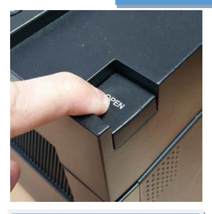
1. Open the printer lid by pressing and releasing the OPEN button.