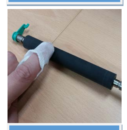
3. Remove the roller from printer and clean using Platen Cleaner Spray and a Lint Free Cloth.