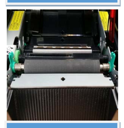
4. Insert the roller back into the printer. Ensure that the green levers are slotted in the metal guide slots.