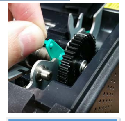
2. Locate and carefully lift the small green levers at both ends of the roller.