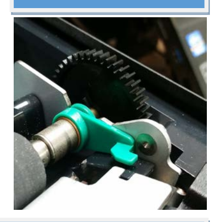
5. Careful lower the green levers until they click into place.